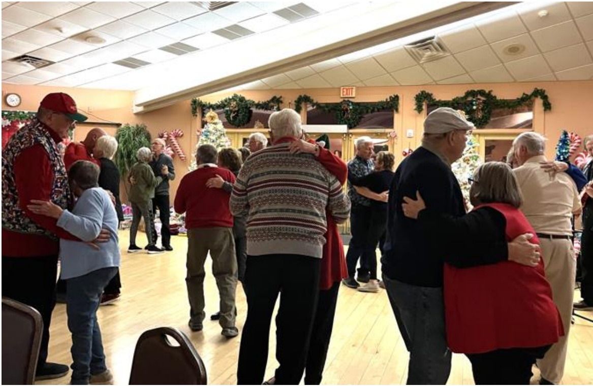
Winners of special gifts from Santa